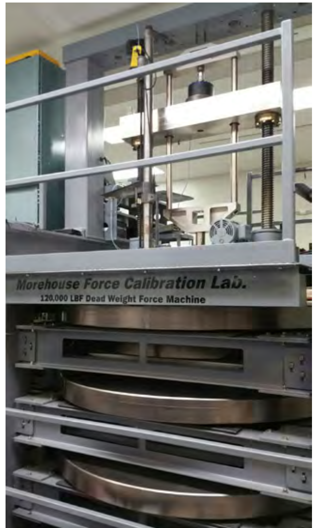
Figure 3. View of Deadweight Machine