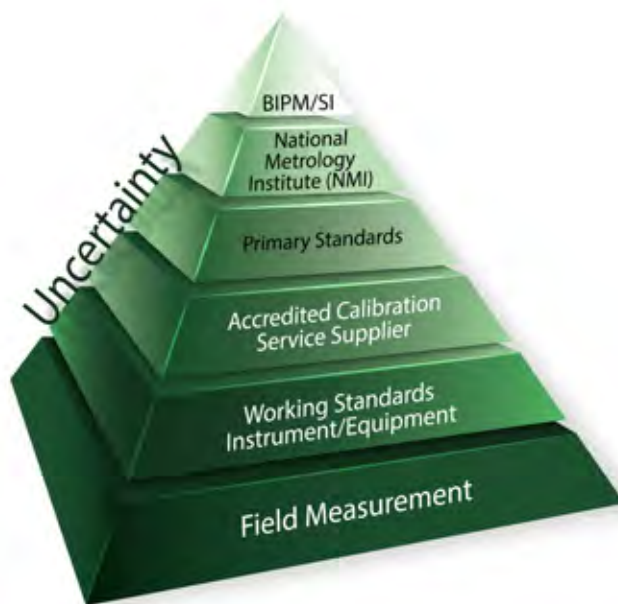
Figure 1. Measurement Uncertainty Pyramid

Henry Zumbrun and Alireza Zeinali Morehouse Instruments